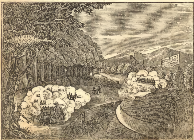
GALLANT DEFENCE OF FORT SANDUSKY, BY MAJOR CROGHAN